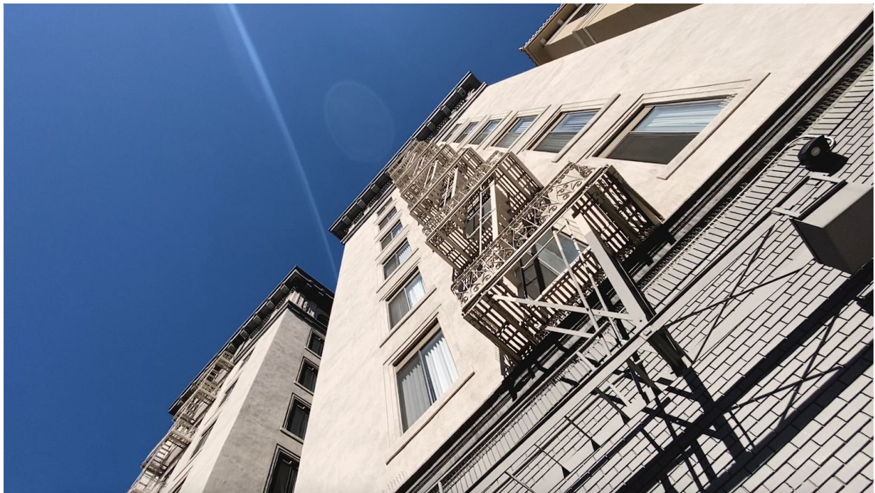
A film still of an Oakland apartment building from SYNCHRONIZED, an experimental documentary short directed by Corinne Manabat Cueva.